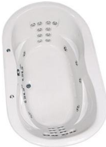
72"x46"x27" Shipping weight - 225lbs

Inside Bottom Dimension 48"L x 28"W (+/- 1/2")